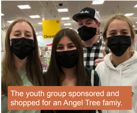
The youth group sponsored and shopped for an Angel Tree family.

P.A.C.K. nights are an excellent way for our 4th-6th graders to come to church, play games, hang out with friends and learn about God's love!